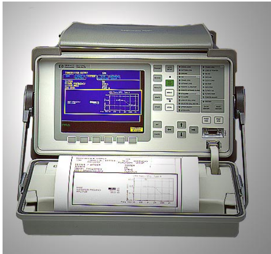
HP 37717C communications performance analyzer with color display, floppy disk drive as standard and optional integrated printer.

To meet your specific test needs, just order the capability you require. Simply order the HP 37717C analyzer and choose the application orientated options you require, from the tables in the pages that follow. Remember, you can configure your analyzer to simultaneously include PDH/DSn, SONET/SDH, ATM and jitter, or you can configure it to contain PDH/DSn only, SDH only, SONET/SDH only, ATM only or almost any combination.